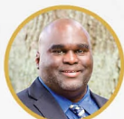
DEACON HAROLD BURKE-SIVERS THE DYNAMIC DEACON