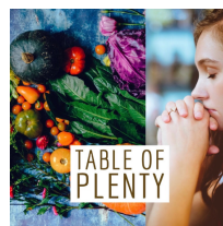
Table of Plenty

For additional information on these positions, please contact St. Francis Church at 217-961-6404 or stfrancischurch.com